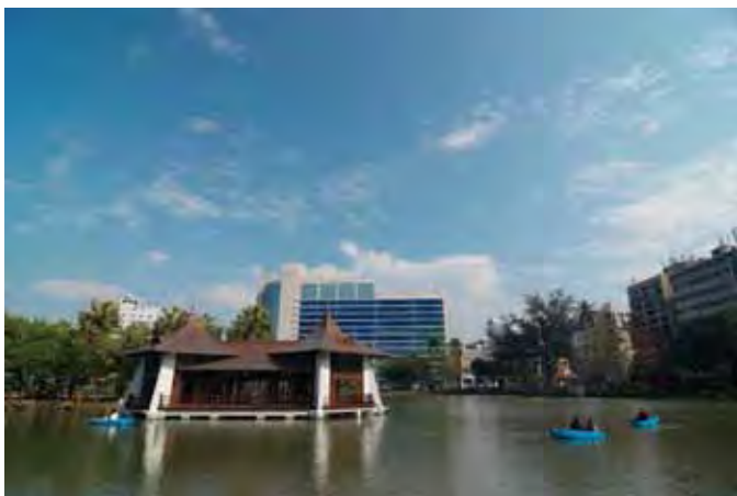
Taichung Park (臺中公園)