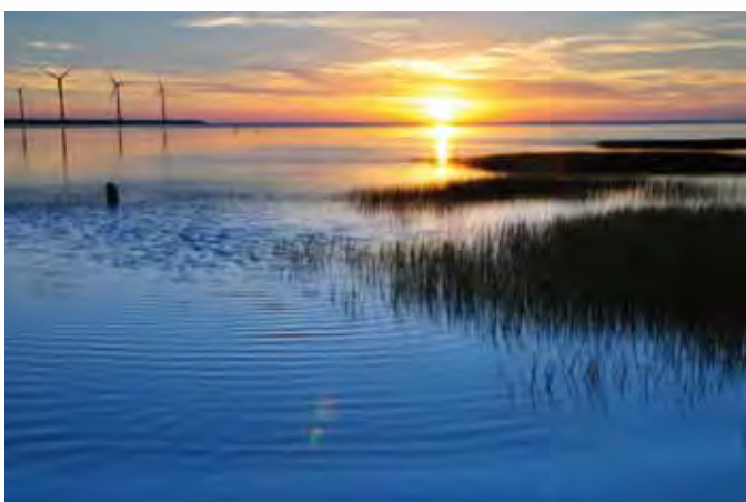
Gaomei Wetland (高美濕地)