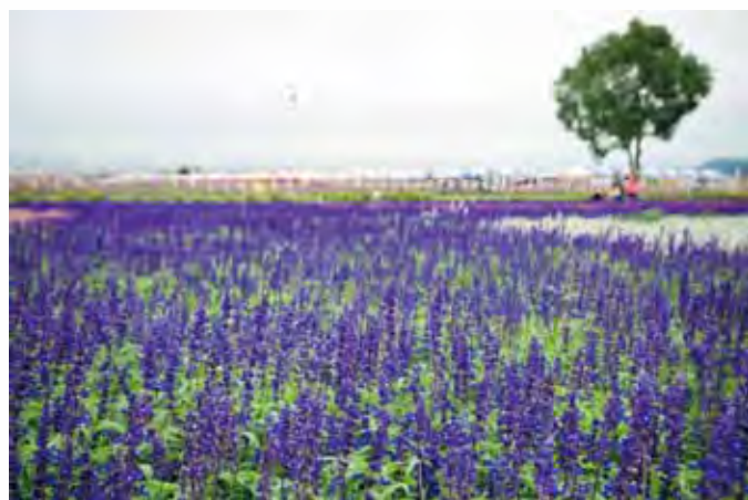
Sea of flowers in Xinshe (新社花海)