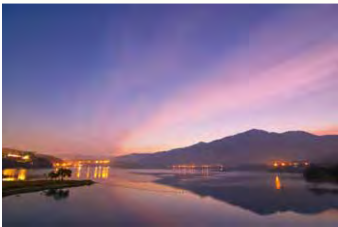
Sun Moon Lake (日月潭)