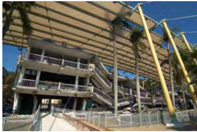
921 Earthquake Museum of Taiwan (九二一地震教育園區)